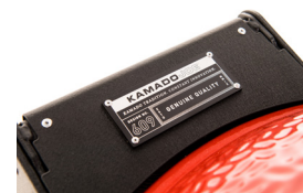
Air Lift Hinge