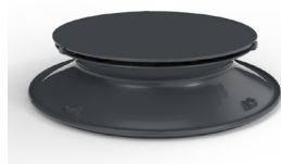
Patented Hyperbolic Insert