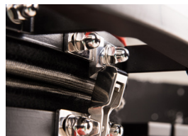
Stainless Steel Latch