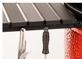
Aluminum Side Shelves