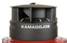
Control Tower Top Vent