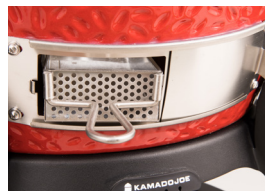
Patented Ash Collector